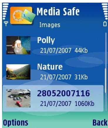
4. Images (list layout)