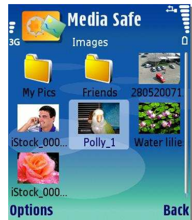
3. Images (grid layout)