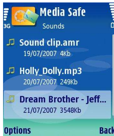
5. Sounds (detailed view)