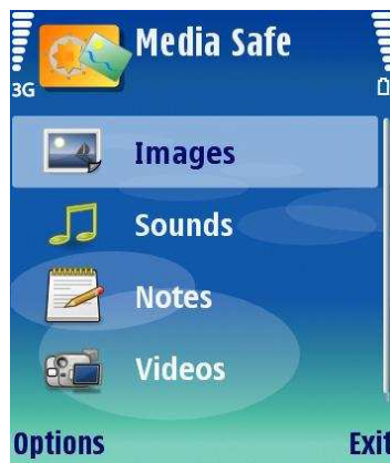
2. Main view, stores for different media types