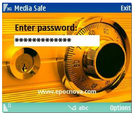
1. Startup screen, prompt for password (landscape layout)